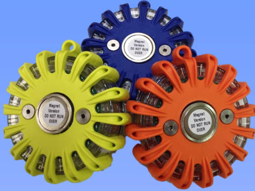
Heavy Duty ~30 Pound Pull