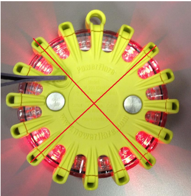
PF210 Series Non-Rechargeable

To identify which type of unit you have, press and hold the power button down. When you do this, every other set of lights will briefly (less than a second) light up. You can repeat this as many times as you need. Notice which ones light up. If they form an "X" (when the large loop/text is oriented upward) the unit is not rechargeable. If they form a "+", the circuitry is rechargeable and can be charged when the provided 3.6V RCR123 Lithium-Ion battery is installed.